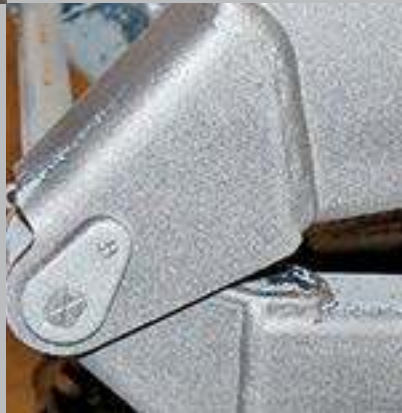
pin and bushing replacement