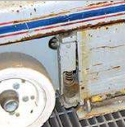
boom cable replacement