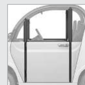
HALF HARD DOOR