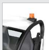
SECURITY LIGHT BEACON