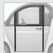
FULL HARD DOOR