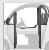
QUARTER HARD DOOR